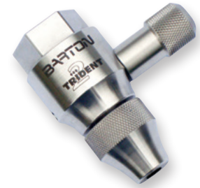
TRIDENT-2 CUTTING HEAD