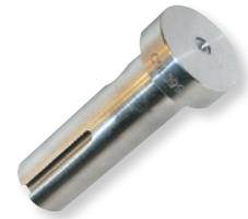
DIAMOND ORIFICE CARTRIDGE